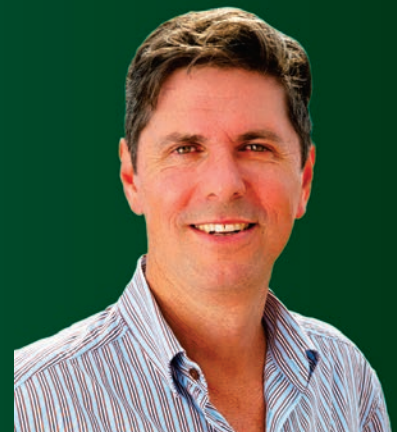
Dave Layzell MP MEMBER FOR UPPER HUNTER

Check the Savings Finder: www.service.nsw.gov.au/campaign/savings-finder